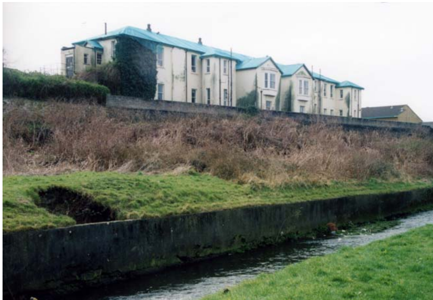
The workhouse was built in 1838/39.