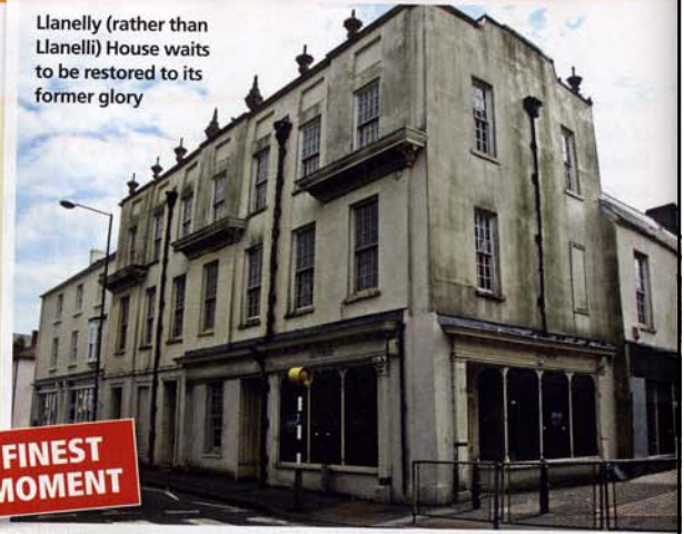
Llanelli (rather than Llanelli) House waits to be restored to its former glory

One group is working with the donated maps. By combining an 1840 plan of the town with family history research, they can highlight buildings and the people who lived