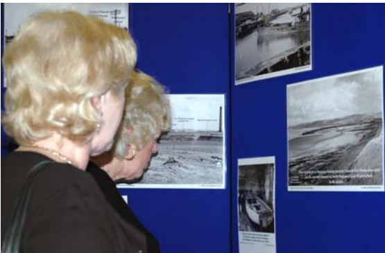
After viewing the collection of photographs on DVD, the exhibition was opened and the audience was able to examine the prints in more detail.

The collection of photographs was the work of the late David Hopkins who died