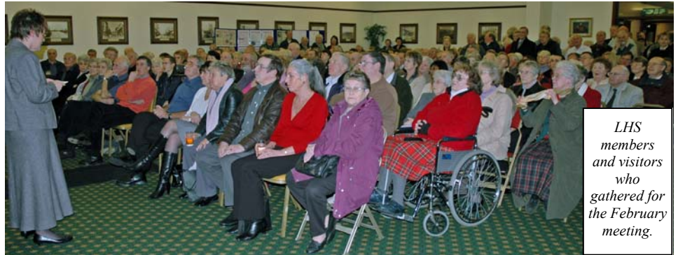
LHS members and visitors who gathered for the February meeting.