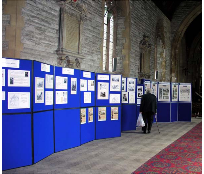
This was the first visitor to the exhibition, after this hundreds of people came through the church during the week..