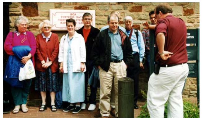
LHS members with their guide during a trip to Caerleon in 2002.

within our membership who can make that commitment. Is there anyone who might consider taking on this task?